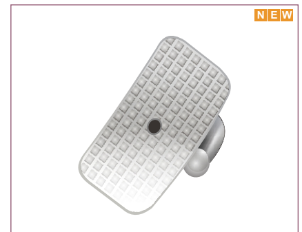
D-Tech Universal Buccal Tube with bondable & weldable base

Micro-etched base gives exceptional bonding even with reduced pad one of mini-tubes. Clearly defined indent allows for "accurate placement"