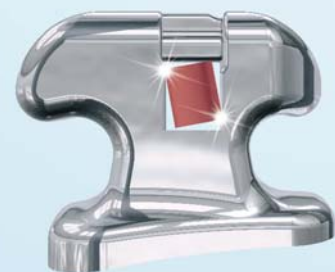
Competing .022 Self-Ligating Bracket

Secondly, third order, or torsional control of anterior teeth is a problem. It became obvious in many cases, especially in extraction cases or in cases where retraction of overjets was needed, that in the torsional interface of a .019x.025 in an .022 slot height, I was losing about 5 to 7 degrees of torque due to the "play" in arch wire to slot dimension as the wire twists and engages torque in the third order.